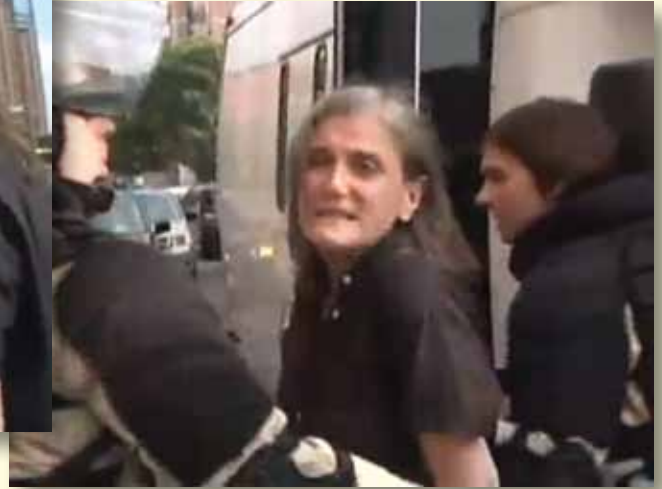
“Democracy Now!” host Amy Goodman and two producers were among the more than 40 journalists arrested during the 2008 RNC convention while covering the protests in downtown St. Paul.