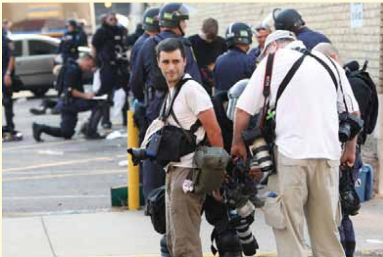
AP Photographer Matthew Rourke was arrested during the 2008 Republican National Convention in St. Paul.