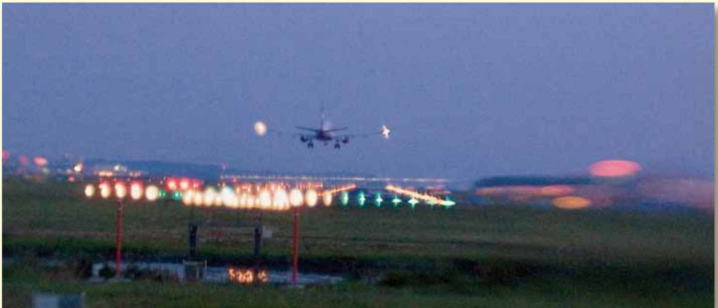
NEWS MEDIA AND THE LAW FILE PHOTO