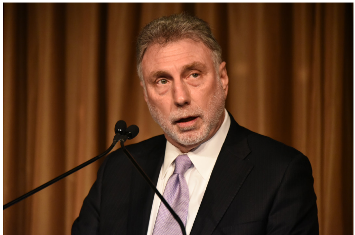
Freedom of the Press Award winner Marty Baron