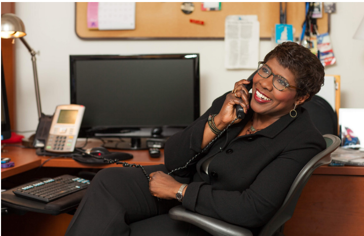
Left: The Reporters Committee paid tribute to Gwen Ifill at the 2017 Freedom of the Press Awards.