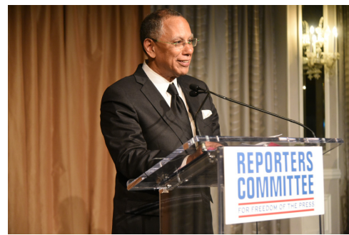
Scenes from the 2018 Awards Dinner