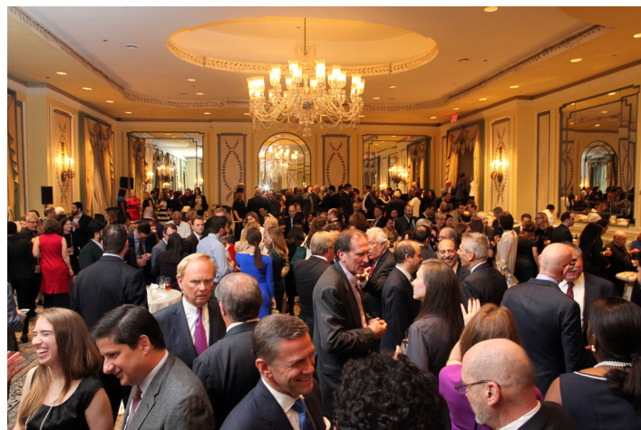
The 2018 Reception Room