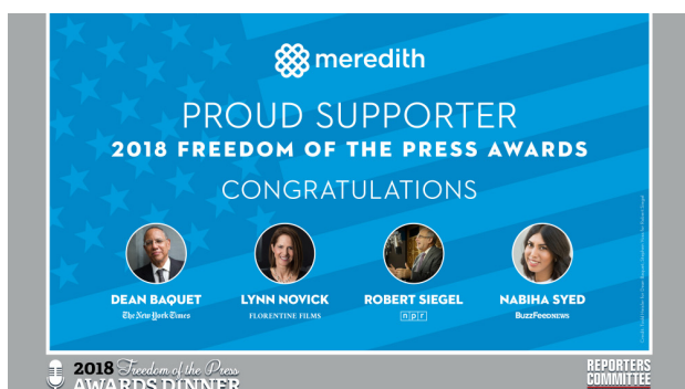
sample ad from 2018