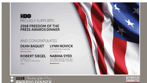
sample ad from 2018