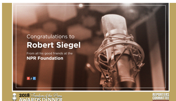
sample ad from 2018