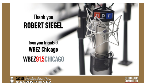
sample ad from 2018