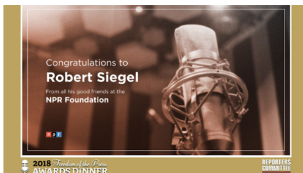
sample ad from 2018