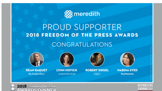
sample ad from 2018