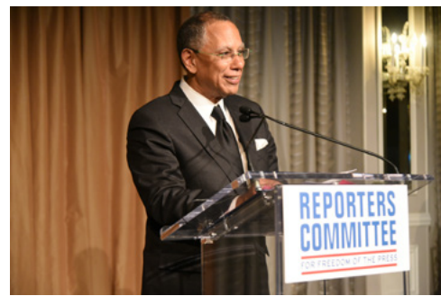
Scenes from the 2018 Awards Dinner