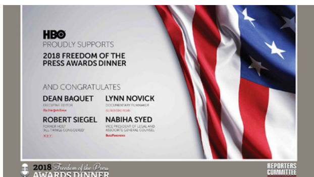
sample ad from 2018